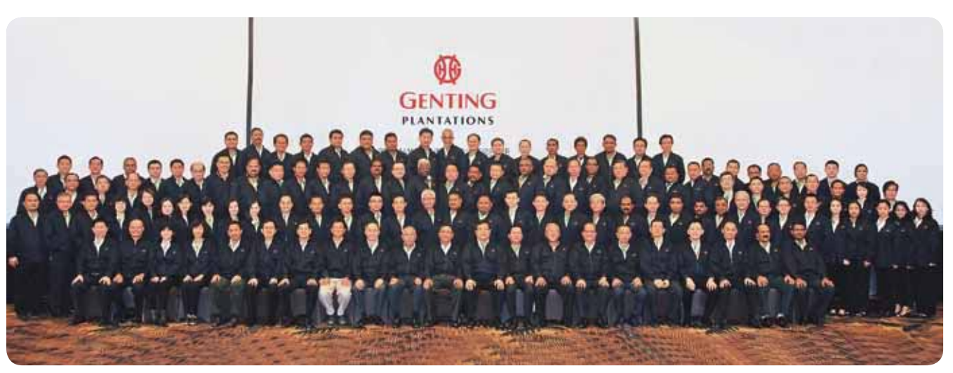
Participants at the 32nd Management Conference

systematically and equitably through an established grievance procedure.