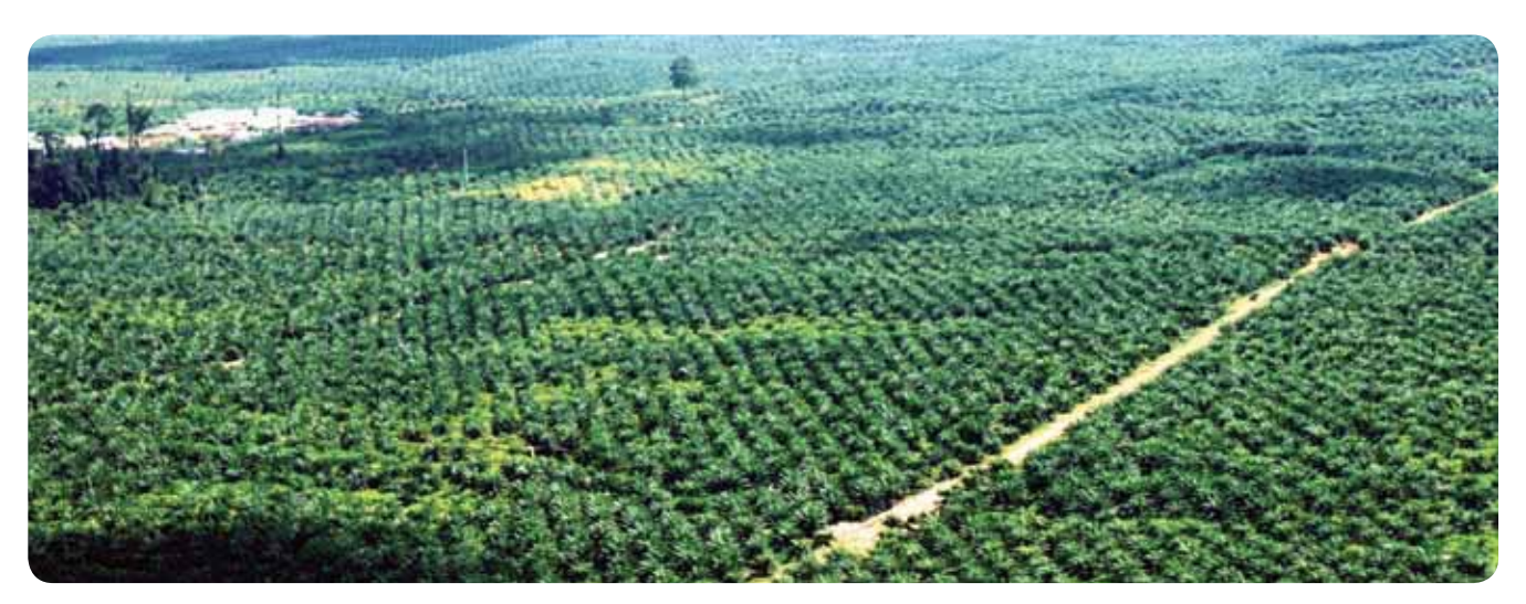
Kapuas Estates, Kalimantan Tengah

At Genting Plantations Berhad, we aspire to achieve a balanced integration of ethical, social, environmental and economic considerations in the way we conduct our business to create sustainable long-term value for our stakeholders.