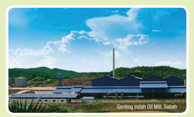
Among the Group's units which were awarded the ISCC Certification in 2013

diesel and electricity. Over and above the context of the ISCC, the tallying of emissions data is in itself a useful exercise to help identify the GHG hotspots in our Group's operations and to guide our internal monitoring and management of GHG emissions. Similarly, the establishment of a Sustainability Management Procedure Manual, developed through the streamlining and integration of existing internal sustainability-related management documents, serves not just to meet ISCC requirements, but also as a reference for the internal control systems of our Group's operating units.