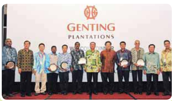
Recipients of the various outstanding performance awards

At all work sites, proper caution signs, emergency protocols and operating instructions are displayed clearly and prominently to ensure all necessary precautions against potential hazards are followed. To reinforce the awareness towards safety and health issues, our people are regularly enrolled in in-house and external training courses. The certification of all our oil mills to OHSAS 18001:2007 and MS 1722:2011 are but some examples of the best practices in